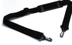
Shoulder strap SB1250 See page SB1250 • NSTP810