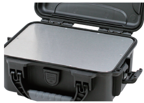
Aluminium panel NKAP series See page NKAP