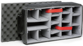
Divider DVI series See page NANUK-ACC-1