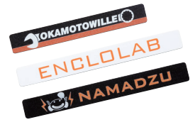
Nameplate sticker NKST See page NANUK-ACC-3